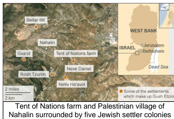
Tent of Nations farm and Palestinian village of Nahalin surrounded by five Jewish settler colonies