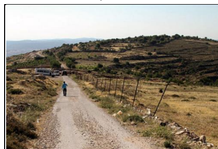
Vehicles park where the access road to the Tent of Nations farm is blocked